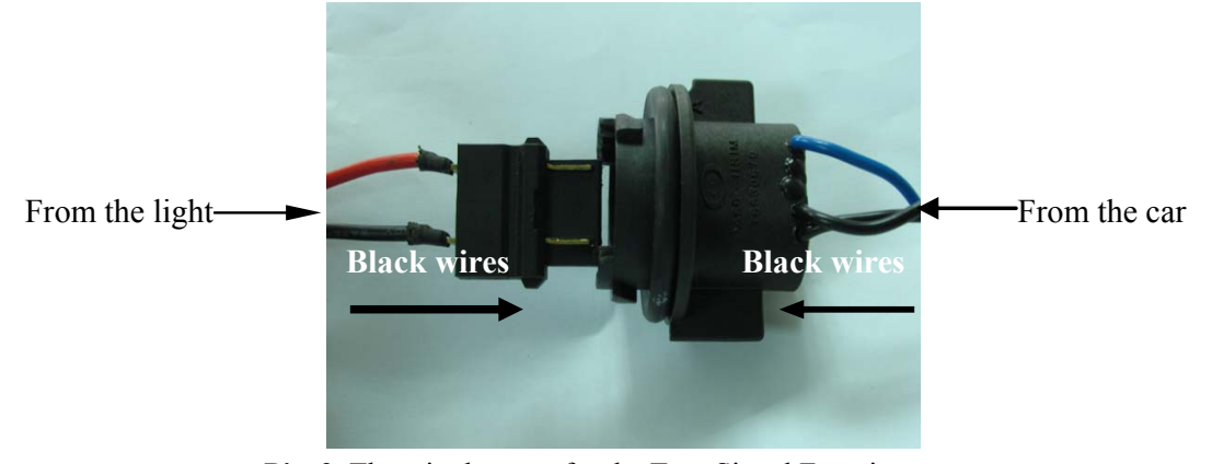
Pic. 2. The wire harness for the Turn Signal Function

Please follow the directions and color of the wires (shown in Pic. 2). Connect the connector with the corresponding wire color. (black wire goes in-line with black wire)